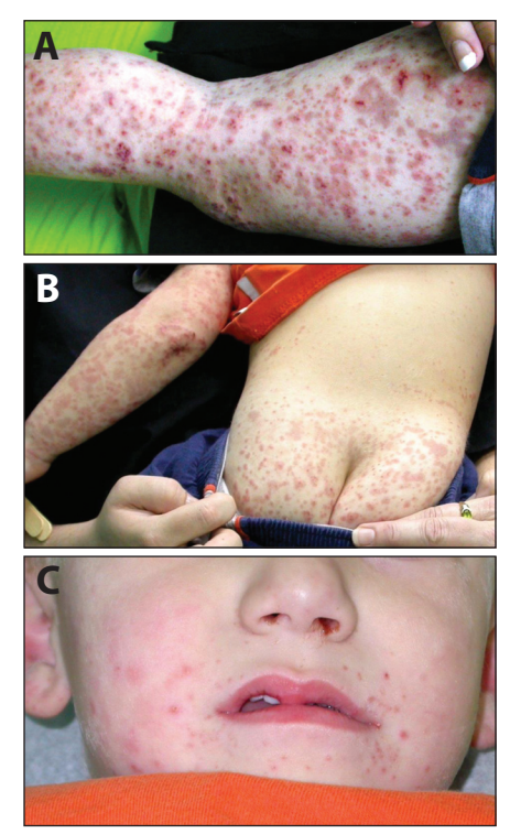
Figure 5. An irritable, unhappy 2-year-old white male who has developed this alarming petechial and purpuric rash on the legs (A), arm and below the waistline (B), and peri-orally (C). Is further testing needed?

Each of these children (ages 13 [ Figure 3 ], 12 [ Figure 4 ], and 2 years old [ Figure 5 ], respectively), who were otherwise healthy and afebrile, shows