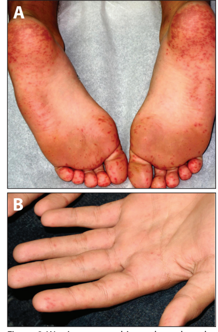
Figure 9. Worrisome petechiae rash on the soles (A) and palms (B) of a 13-year-old male who has sore throat and fever (102.5°F). It is summer, and he has been camping, but the mother can recall no tick bites recently. Further testing? Or a more thorough physical examination?

graph ( Figure 11 ) is more ill appearing and sleepy. He has been previously healthy and has no history of tick bites or travel. He has had a fever for the past 2 days (101.3°F today), headache, moderate photophobia, no nuchal rigidity, and some lower extremity joint aches. He also has moderate abdominal pain, so you are also worried about the vasculitis of HSP. The rash is scarlet fever– like with macule-papules interspersed with petechiae.