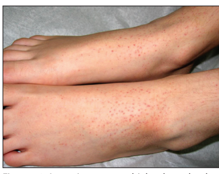
Figure 10. A worrisome petechial rash on the dorsum of the feet and up to the knees (not shown) in an afebrile 14-year-old female who only reports a sore throat. A careful physical examination may reveal the causative pathogen.

You decide to admit him to the hospital for blood culture and parenteral ceftriaxone antibiotics. His mental status and neck suppleness remain unchanged over the next several hours, so you do not think a lumbar puncture is worthwhile. He does not have meningitis, so you do not think that he initially needs either vancomycin or steroids as well.15 Within 24 hours, most of his fever and illness symptoms have dissipated, except for the joint aches. His blood culture is now growing a gram-negative cocci. Your index of suspicion was correct: He was affected by both the ominous and not-soobvious-early meningococcemia.