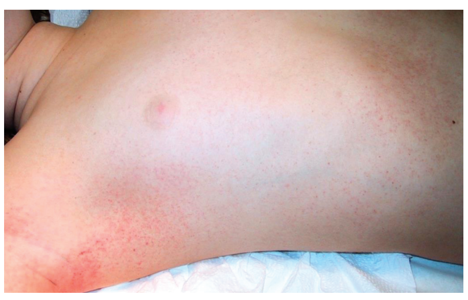
Figure 11. In April, this 10-year-old male developed headache, abdominal pain, generalized arthralgias, and fever (101.3°F) along with these petechiae all over the trunk in a scarlet fever–like distribution. In your practice, does this series of cases remind you of the fable of the little boy who cried wolf too many times? Is further testing needed?

To avoid many of the pitfalls in diagnosis, practitioners will need to be thorough in history taking, assessing fever and immunization status, and physical examination. Also, you will usually