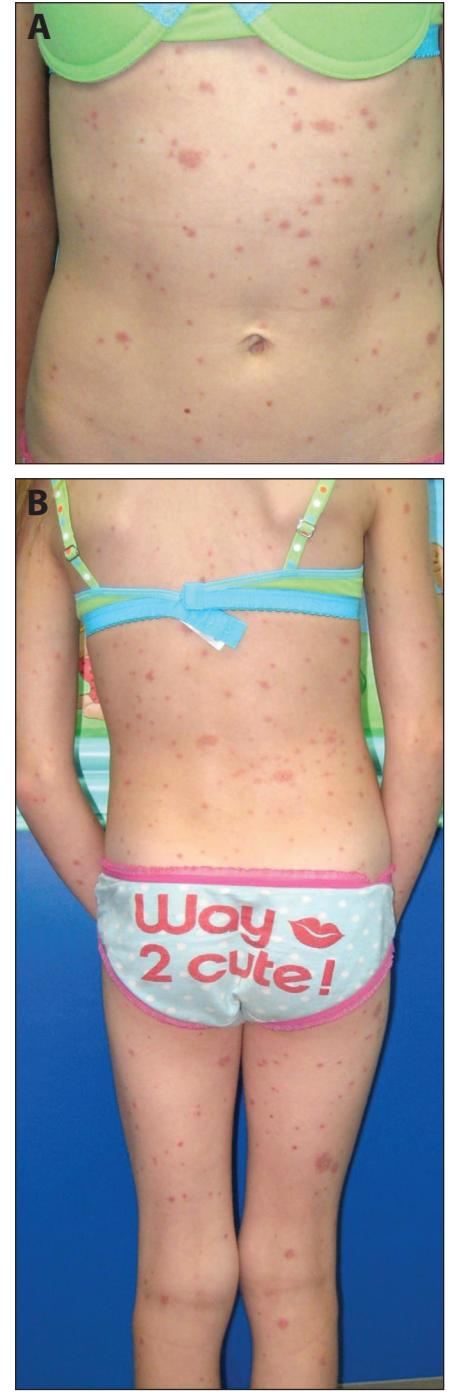
Figure 3. Note the full body (A) and arm (B) distribution of the lumpy purpuric rash in this 13-yearold white female who is afebrile and has no other symptoms.

After all, you have been taught that the rash rarely goes superior to the waistline or on the arms. But one of the keys to this diagnosis is the usual lack of any systemic illness signs or fever.