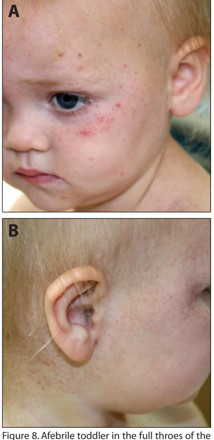
Figure 8. Afebrile toddler in the full throes of the "terrible two's", who has no cough, vomiting, or illness. You are perplexed as to the cause of her facial petechiae. She is certainly not happy that you are visiting with her today.

These two patients with streptococcal pharyngitis show a worrisome distribution of petechiae (ie, on the feet and palms, extending up to the knee) ( Figures 9-10 ). Because RMSF classically presents with a rash starting on the hands and feet, which spreads centripetally, you must be particularly attuned