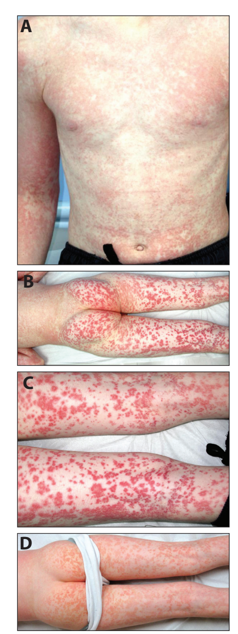
Figure 2. An 11-year-old White male who developed this morbilliform measles-like rash 4 days into treatment with amoxicillin for streptococcal pharyngitis (A). His fever is still 101°F, his lymph nodes and abdomen are normal, and his leukocyte count is normal. Further testing? When the patient showed a positive monospot test, his doctor switched him off amoxicillin and substituted oral cephalexin. Four days later, the patient developed this full-body "lumpy" purpuric rash (B, C). He is now afebrile and has minimal other symptoms. Allergic reaction? Refer? Hospitalize? Treatment? The morbilliform purpuric rash in the 11-year-old male has markedly dissipated 24 hours after being treated with which drug (D)? (Answer can be found in the text.)

Although he has classic palpable purpura, the distribution of the rash is too extensive to be typical for HSP or immunoglobulin A (IgA) vasculitis. Or is it?