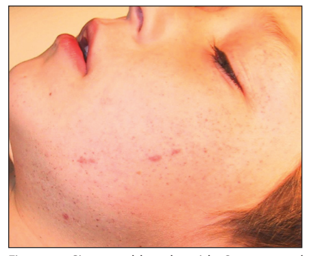
Figure 7. Six-year-old male with Streptococcal pharyngitis , lymphadenitis, and fever 101°F, who has developed this petechial rash on his face.

these children with a positive streptococcal pharyngitis test, may actually be streptococcal carriers.