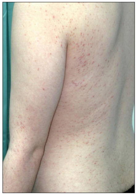
Figure 4. Note the petechiae on the trunk and upper extremity in this 12-year-old white male who is afebrile and has no other symptoms. Is further testing needed?

ogy is hard to extinguish. For years in our office, we have been treating streptococcal pharyngitis with amoxicillin as the first-line agent. We observe probably 50 to 100 cases of mononucleosis annually, of which at least 5% are coinfected with streptococcal pharyngitis, and several will also develop acute otitis media or sinusitis, which we have almost uniformly treated with amoxicillin, as well. We rarely ever have observed a rash in this group of children. A recent report regarding Israeli children seems to confirm our anecdotal findings. Among children with mononucleosis, the incidence of rash was not any different for children who had received amoxicillin versus those who had not (29.5% vs 23%).<sup>13</sup>